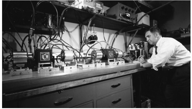
► Fig. 2. Joseph Geusic with a solid-state laser and two amplifier stages at Bell Labs.

lasers, preferably four-level lasers operating at room temperature, with broadband laser transitions that would allow wide spectral tunability for scientific and commercial laser applications. The first such solid-state lasers were realized in 1963, when L. F. Johnson, R. E. Dietz, and H. J. Guggenheim [13] of Bell Telephone Laboratories identified divalent nickel, cobalt, and vanadium in magnesium fluoride crystals as four-level laser gain media for widely tunable lasers in the near-infrared spectral range. Peter Moulton details the development of these and later tunable solid state lasers elsewhere in this section.