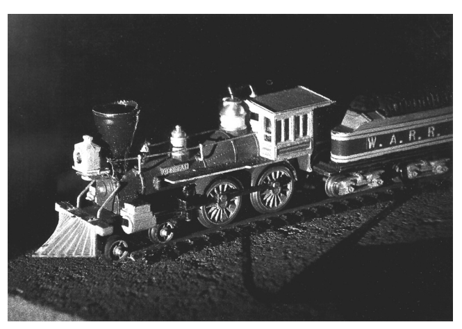
▲ Fig. 3. Iconic photo of holographic toy train.

They faced tough technical problems such as isolating their holographic setup from wavelength-scale vibrations. Moving to a massive granite optical bench im-