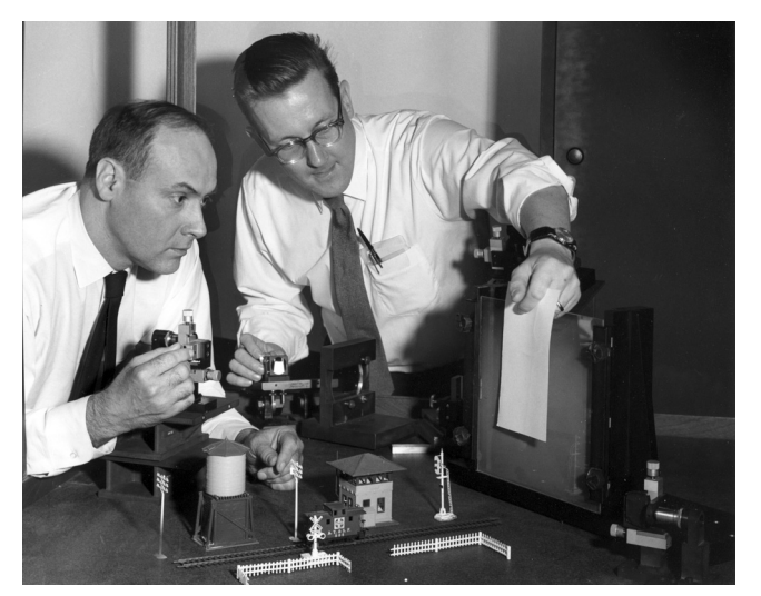
▲ Fig. 2. Emmett Leith and Juris Upatnieks in 1965.

Leith put Upatnieks to work making Gabor-style holograms while they waited for his clearance. Despite lacking optics experience, Upatnieks succeeded. The reconstructed images were fascinating but had the same twin-image problem as Gabor's.