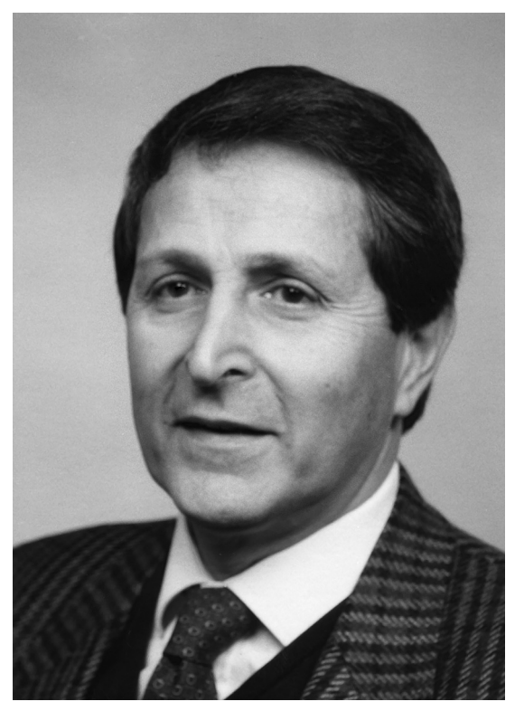
▲ Fig. 4. Claude Cohen-Tannoudji.