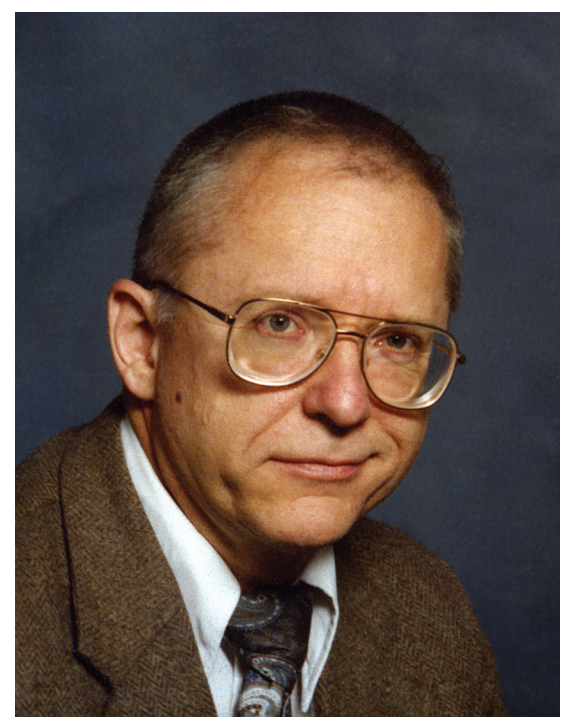
▲ Fig. 5. John Hall.

radiation via nonlinear mixing. Yet once again a 20-year interval would pass before Rohlsberger was to achieve electromagnetically induced transparency at x-ray wavelengths, thereby hinting at the prospect of nuclear quantum optics.