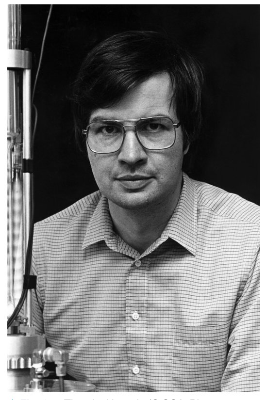
▲ Fig. 2. Theodor Hänsch.

220 Linear and Nonlinear Laser Spectroscopy