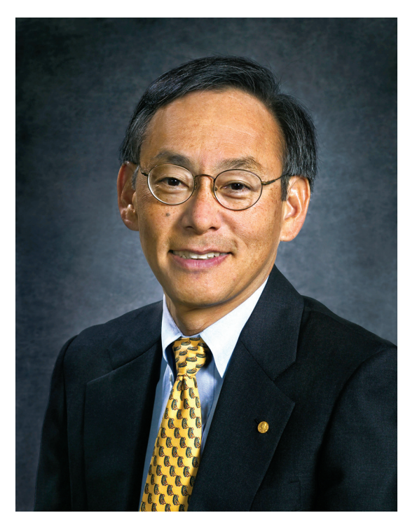
▲ Fig. 3. Steven Chu.

The transition from spectroscopic research in the period 1960-2000 to its many applications had a long gestation period. D. Auston disclosed a method of generating single cycles of terahertz radiation in the 1980s. However, applications such as imaging through plastics and ceramics with terahertz waves would not become routine until the beginning of the twenty-first century. Similarly, as early as 1980, T. Heinz and Y. R. Shen found that second harmonic generation was allowed on the surfaces of centro-symmetric media but forbidden in their interior. IBM exploited this interaction to inspect silicon wafers for electronic circuits, but decades passed before species-specific structural and dynamic studies became popular with chemists. By the 1990s, experiments in the research groups of S. Harris and B. P. Stoicheff had established that opaque materials could be rendered transparent through quantum interference. This had immediate impact on spectroscopy and the generation of short wavelength