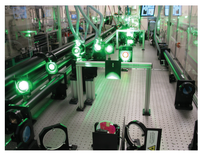
▲ Fig. 3. One of the two Gemini amplifiers at Rutherford Appleton Laboratory, showing, in the center, a green-laser-pumped Ti:sapphire crystal 90 mm in diameter and 25 mm thick. With 60 J of pump energy the system has generated 25 J of output energy in a 30 fs pulse.

Key new advances in tunable solid state lasers are now almost entirely driven by their application to ultrafast pulse generation and include diode-pumped, rare-earth, Yb-doped crystals that can generate pulses on the order of 100 fs, and Cr<sup>2+</sup>-doped ZnSe and similar II-VI