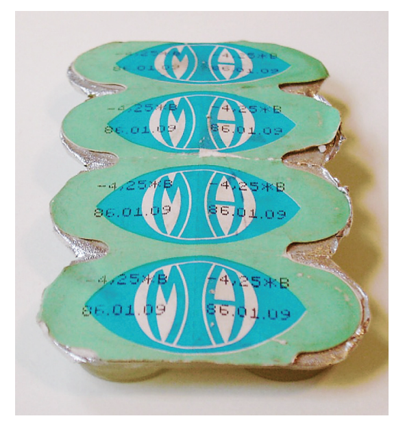
▲ Fig. 4. Examples of the first disposable soft contact lens. Although the Danalens lens design and material were not unique, the packaging and delivery concept were innovative and ultimately changed the way contact lenses were sold the world over.

moved to improving end-of-day comfort through design and material formulation, as well as improved optical performance. This last development has been driven by the development of clinically applicable Hartmann-Schack wavefront sensors. Porter et al. [5] measured the wavefront error of the eye of a large contact-lens-wearing population, identifying that the Strehl ratio of the eye can be significantly improved by correcting at least the major higher-order wavefront aberrations. This technique proved to be an ideal method to evaluate the optical performance of contact lenses on and off the eye, and OSA members led the development of standards for reporting the optical aberrations of eves. Ideally, individual prescription contact lenses should be made for each eye based on wavefront measurements performed in a clinical setting, enabling correction of all higher-order aberrations for improved low-light vision. Although the feasibility of this concept has been demonstrated by Marsack, the challenge for industry is to deliver these customoptics contact lenses in the same low-cost, disposable paradigm that patients and clinicians are currently using. In the meantime, at least one manufacturer (B&L) is altering the inherent spherical aberration of their spherical and toric contact lens