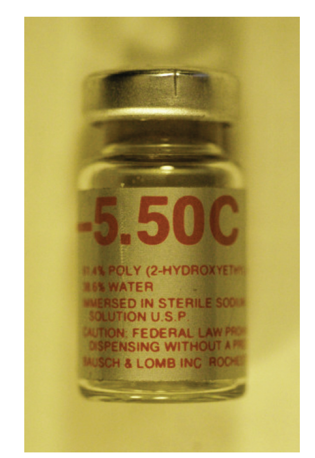
▲ Fig. 3. The first commercially available soft lens in the U.S., the Bausch & Lomb "C" Series.

In the intervening years, others were still chasing the ultimate in convenience, a lens that was so physiologically compatible with the eye that it could be worn continuously for 30 days